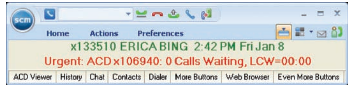
Compact mode provides a smaller footprint, yet access to all the companion applications plus the quick access toolbar for telephone controls